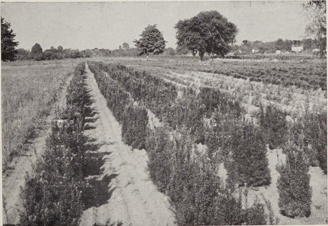
Taxus hicksi — full, bushy specimens. See page 31.